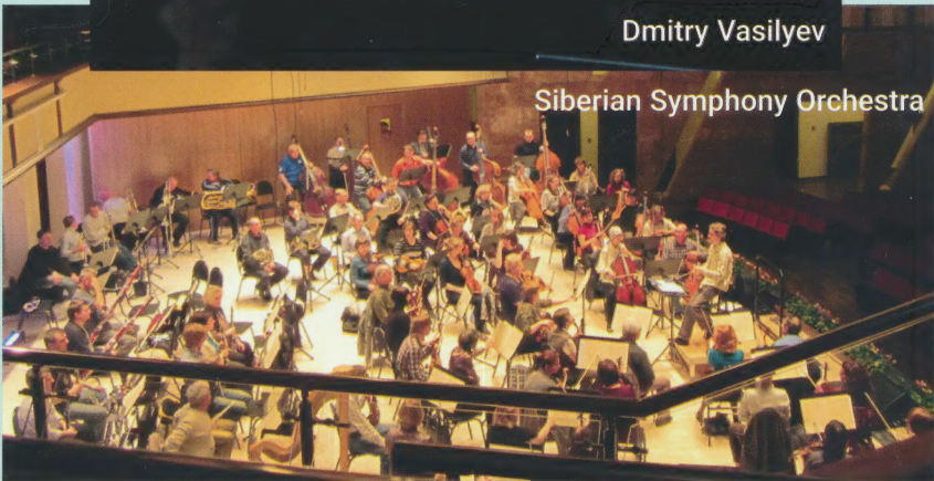
Siberian Symphony Orchestra